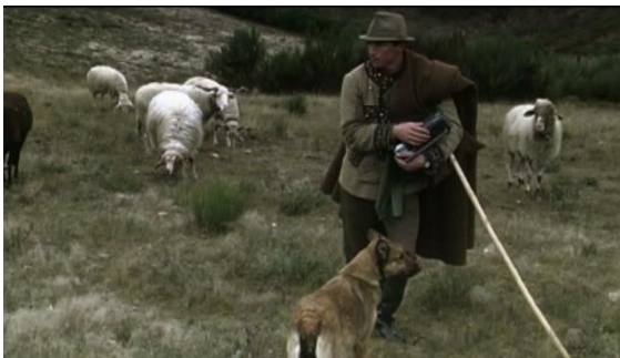
"Ainda Há Pastores?"